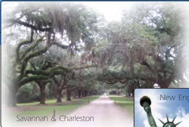
Savannah & Charleston